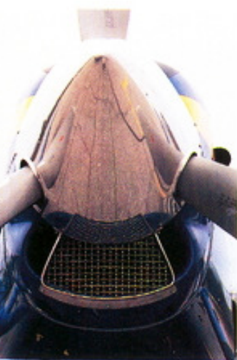
Optional Bird Deflector Installed on the Garrett Thrush