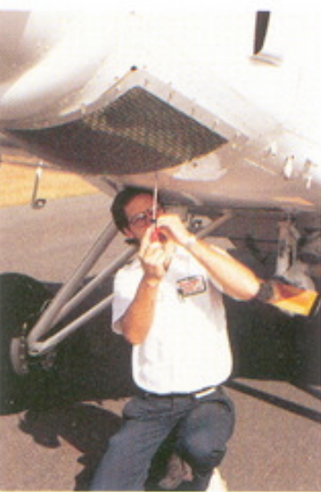
Quick Change Inlet Filter