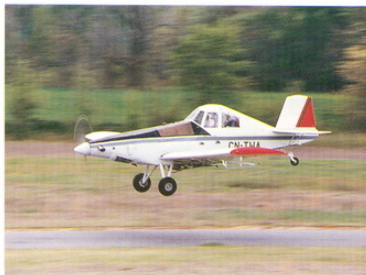
Dual Cockpit Turbo Thrush

This combination has been the choice of operators for almost twenty years. The quick change, barrier filter system design of the Turbo Thrush is engineered for ag aviation.