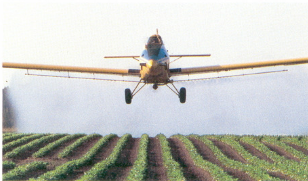
Turbo Thrush with the Reliable PT6A-34 AG Installed (750 SHP)

Either way, you get an aircraft with a long reputation for reaping profits.