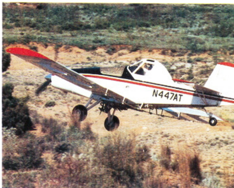
Garrett Thrush with a TPE-331-6 Installed (750 SHP)

A healthy appetite for productivity is built into every Thrush. These versatile ag aircraft are adaptable to the full range of jobs. Thrush capabilities cover all your job opportunities: seeding, spraying, fertilizing and such specialized operations as firebombing.