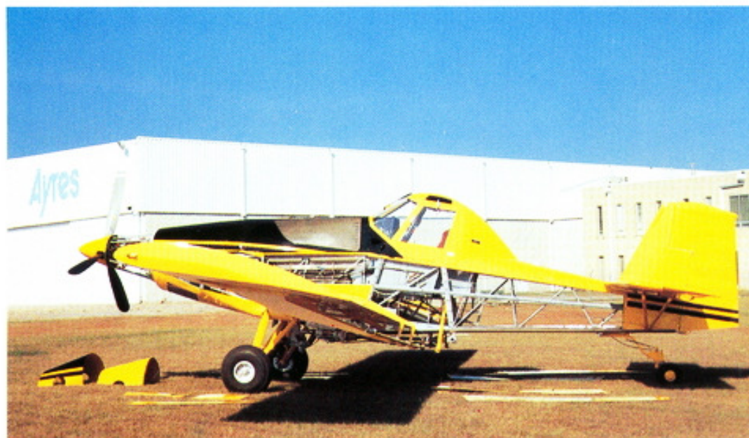
Turbo Thrush Quick Removable Panels

Thrush maintenance ease is demonstrated in its universal dispersal system, easy interchange between application systems (only simple tools required), and designed-in service accessibility of engines and systems. Plus, the speed and ease with which Thrush strips down for cleaning and maintenance.