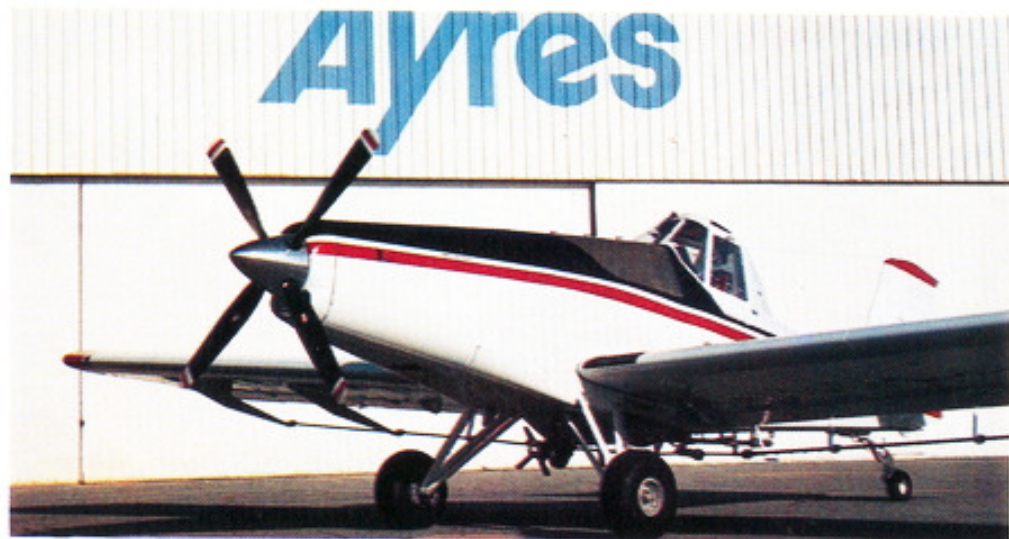
Optional 331-10 Powered Thrush (940 SHP)